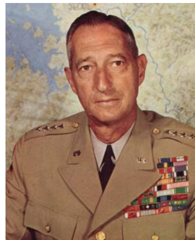
General Mark Clark leader of the U.S.’ Fifth Army in Italy